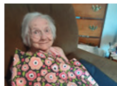
This resident was excited to show off her new pillowcase.