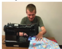
Members learned new skills like operating a sewing machine.