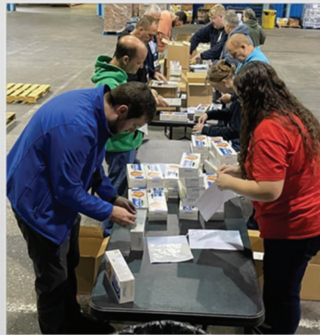
Mountaineer Food Bank