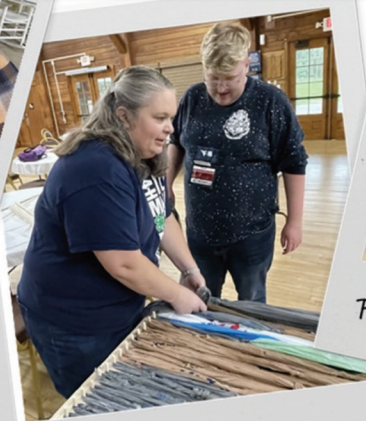
Plastic Mat Loom