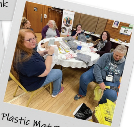
Plastic Mat Preparation