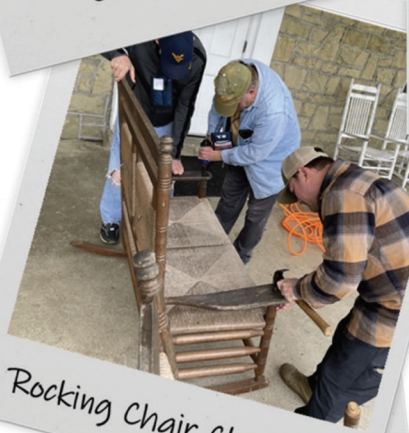
Rocking Chair Clean Up