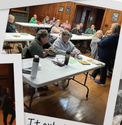
It only takes a spark!