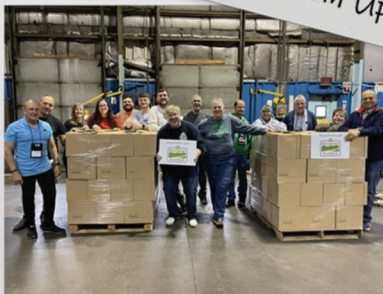
Mountaineer Food Bank