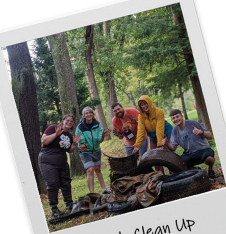
Creek Clean Up